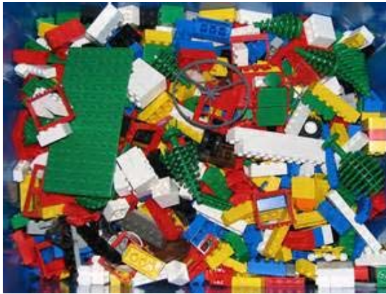
What it looks like today